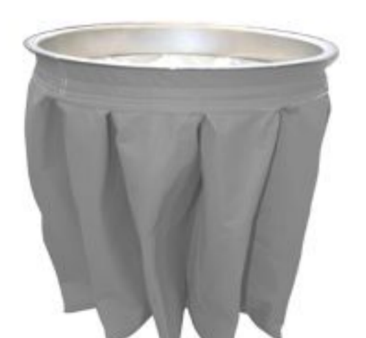
FILTER M CLASS 24.000 CM 2