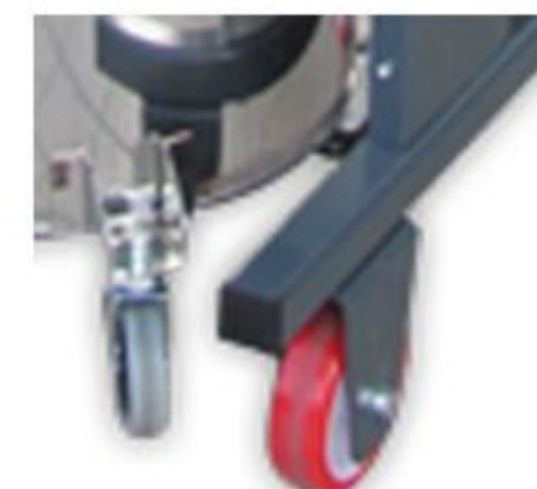
TRACELESS WHEELS WITH BRAKES