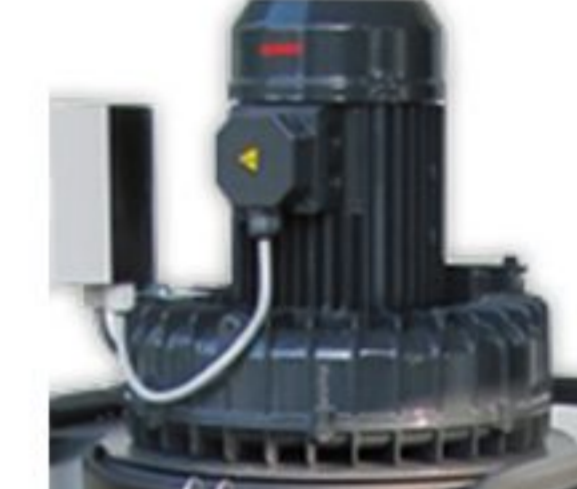
THREE PHASE TURBINE GROUP KW 3