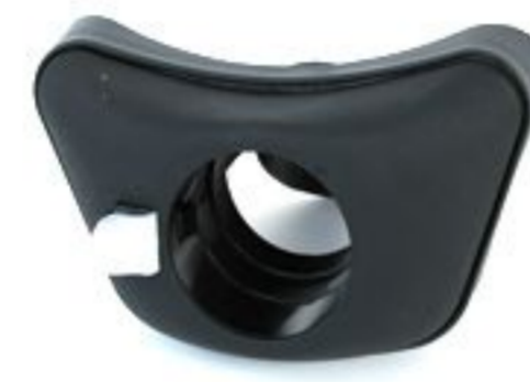
HERMETIC CLICK MOUTH Ø 60