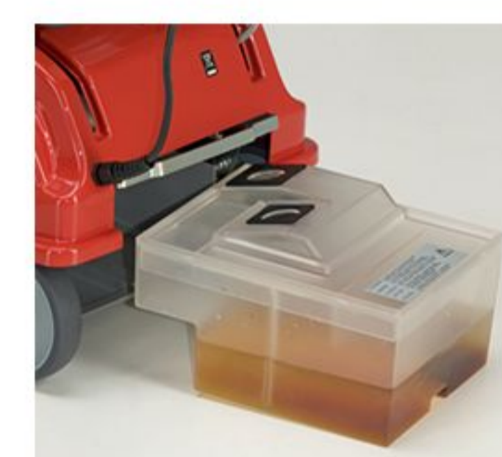
easy removable tank