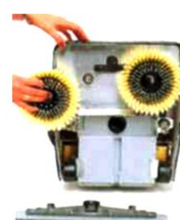
Double brush system with liquid suction