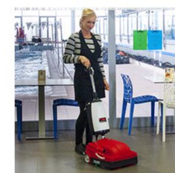
Strong build, easy and compact