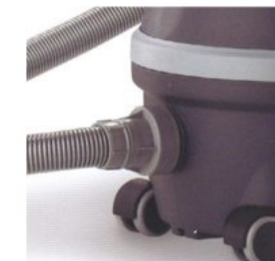
fixed hose with anchor screw