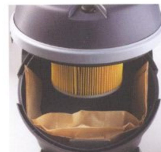
double filter: cartridge filter plus paper filter