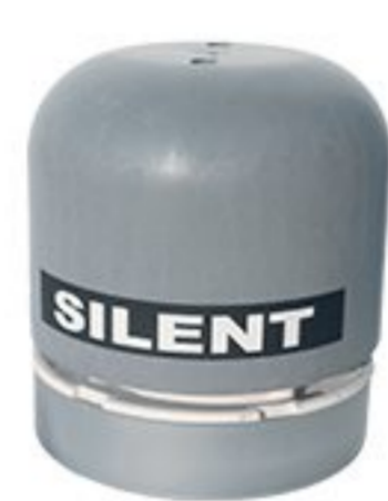
noiseless engine 800 w