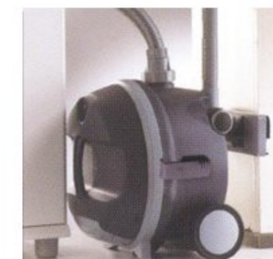
easy to place while steady