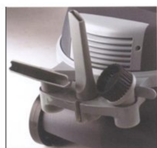
carriage for accessories