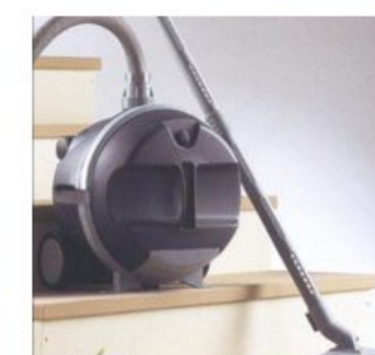
easy to use on stairs